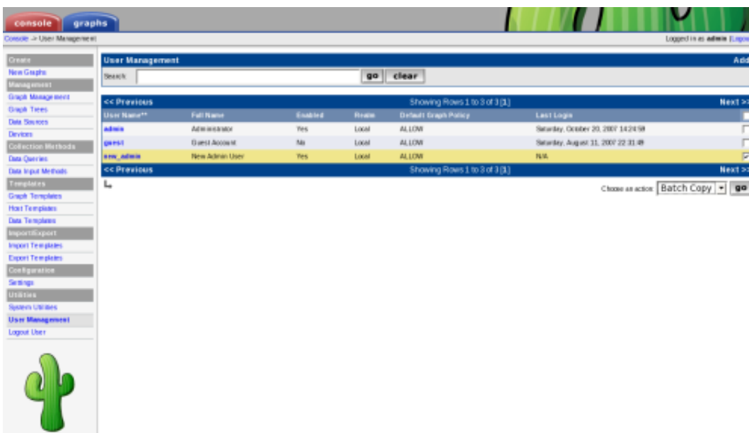
Figure 9-8. Batch Copy Users Part 1

Batch Copy is a helpful utility that helps Cacti Administrators maintain users. Because Cacti does not yet support groups, it is important that there is some way to mass update users. This what Batch Copy does for you.